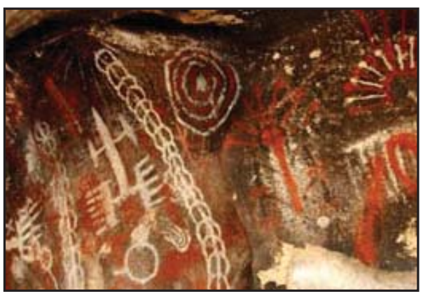
EXHIBIT 3: Burro Flats Painted Cave